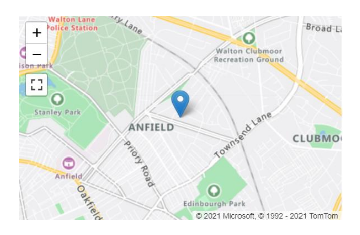
Pinehurst Primary School, L4 7UF

Use this space to provide any further information about your pupil premium strategy. For example, about your strategy planning, or other activity that you are implementing to support disadvantaged pupils, that is not dependent on pupil premium or recovery premium funding.