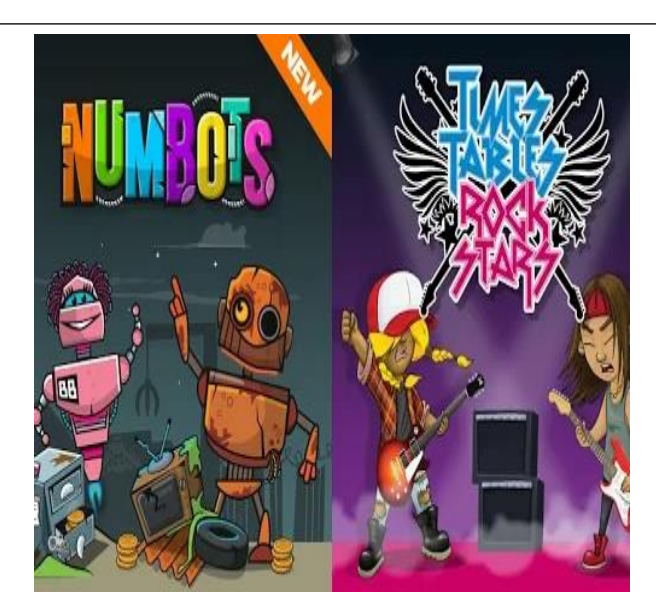
Keep up the good work with TTRS and Numbots. Keep those Maths Brains working!