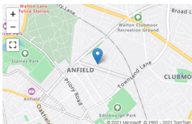
Pinehurst Primary School, L4 7UF

We have put a robust evaluation framework in place for the duration of our three-year approach and will adjust our plan over time to secure better outcomes for pupils.