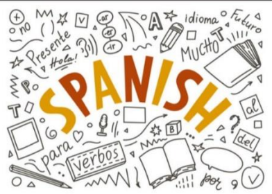
Modern Foreign Languages Spanish

A high-quality languages education fosters children's curiosity and deepens their understanding of the world. We understand that it is important for Children to be given the opportunity to express their ideas and thoughts in another language. We teach Spanish from throughout the school linking with class topics and school projects where possible. In KS2 the childrenccover all the skills required in the National Curriculum, speaking, listening, reading, writing and grammar building on the language learnt in KS1. Early language teaching provides the foundation for learning further languages and opportunities to study and work in other countries.