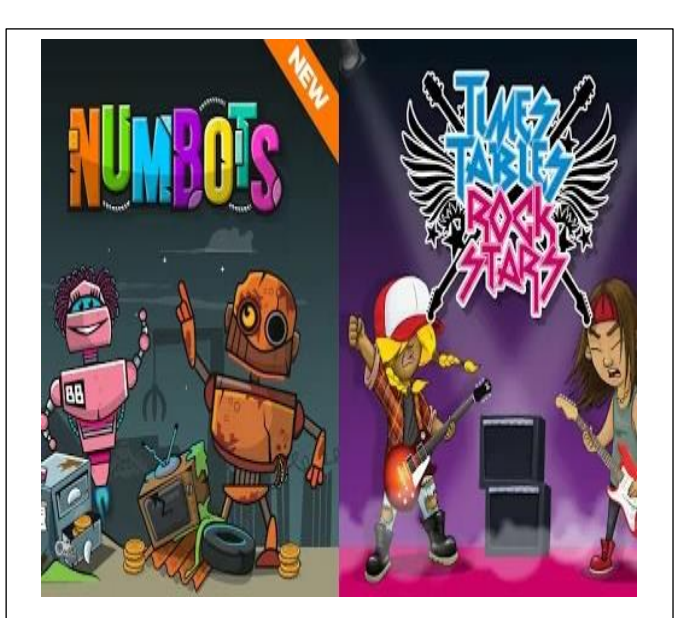
Keep up the good work with TTRS and Numbots. Keep those Maths Brains working!

We break up for Whit Half term on Friday 24<sup>th</sup> May Summer 2 starts for pupils on Tuesday 4<sup>th</sup> June We break up for Summer Holidays at 1.40/1.50pm on Friday 19<sup>th</sup> July